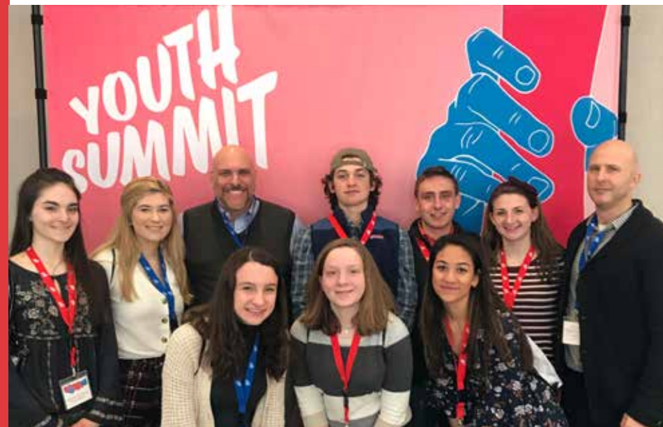
Pinkerton students participated as facilitators in the NH youth summit, leading conversations about mental health issues facing adolescents.