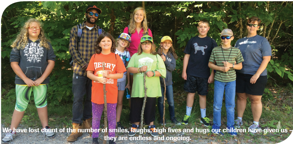
We have lost count of the number of smiles, laughs, high fives and hugs our children have given us - they are endless and ongoing.